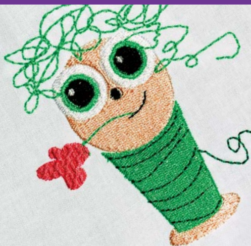
A TRUE ORIGINAL Show off your true colours with a personalized style all your own.