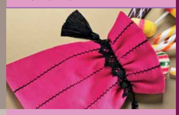
Stylish ideas = enchanting gifts. Created using Elna's optional fagoting plate.