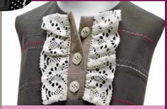
Simple and stylish: even your buttonholes can't help but impress. You'll puff up with pride at the results!