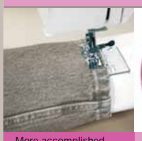
More accomplished than Mary Poppins! The free arm makes sewing tubular a snap!