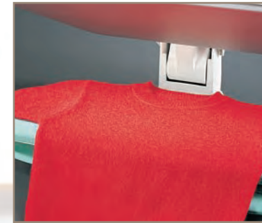
Delicate knits are easy to handle