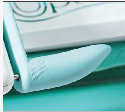
Safety lock for transporting