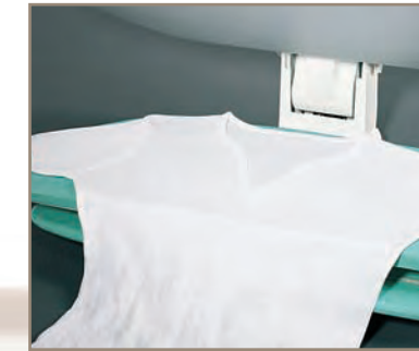
No sagging, no unwanted wrinkles