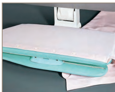
Press a shirt in under a minute