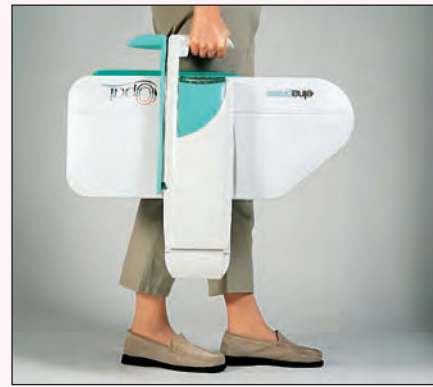
Easy to carry, easy to store