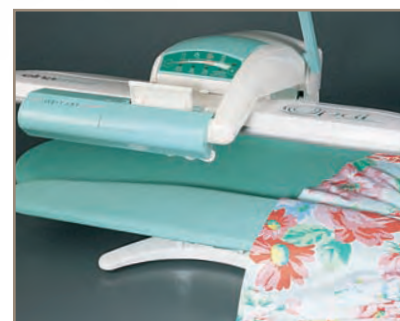
Pay attention to details