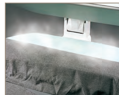
Produce professional creases with steam