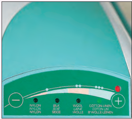
Easy to use LED