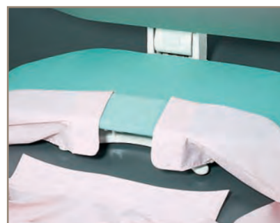
Place sleeve cuffs on Sleeve Board