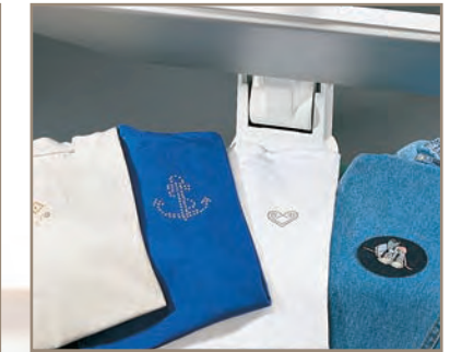
Attach elegant rhinestones and fun patches

The Elnapress Opal also comes with special features such as the Vap-O-Jet and an integrated sleeve board. The Vap-O-Jet will give you the benefits of steam using regular tap water. The sleeve board simply pivots into place and will help you iron difficult to reach areas and small items such as children's clothing.